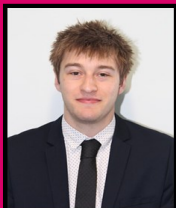
Deputy Head of Personal Development